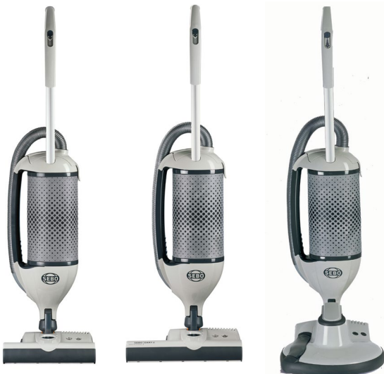
SEBO DART 1

06 Patented computerised disc drive Its automatic torque controlled height adjustment guarantees that the floor pad is at the optimum setting. A quick and easy pad-change mechanism.