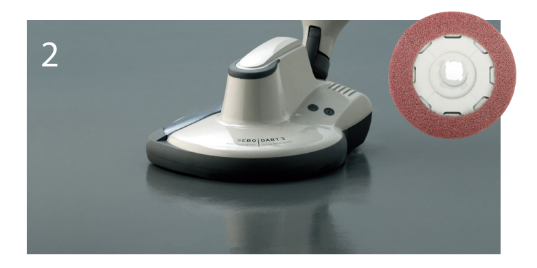
After use of RED Floor Pad